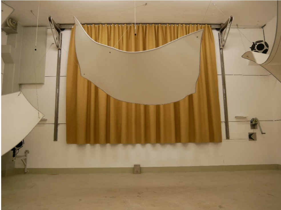
Figure B.1. Test object mounted in the reverberation room, frontal view.